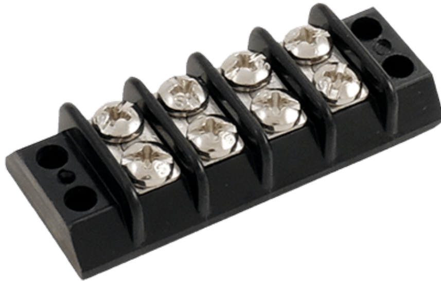
670A GP 04