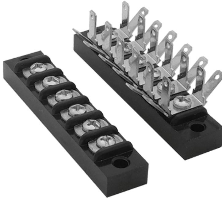
410 GP 06 PSB & 411 GP 06 KT11 KT12