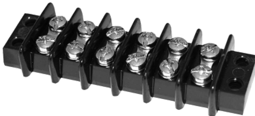
601 GP 06