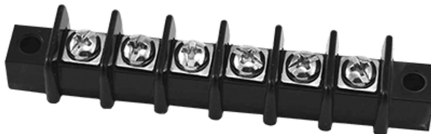
699 GP 06