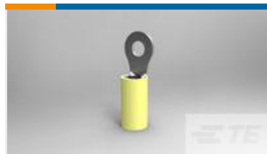
TE Part #1-35787-0 N PIDG RING 12-10 8