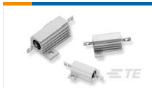
TE Part #1879363-4 THS75 4R7 5%