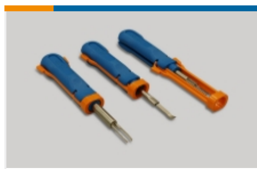
Insertion & Extraction Tools(6)