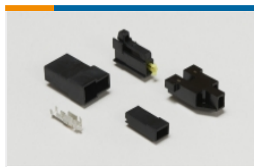
Magnet Wire Terminals(1)