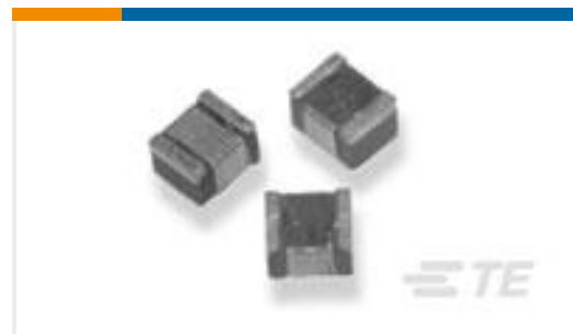
TE Part #4-1879023-8 3650 1008 10uH 5% 2K RL