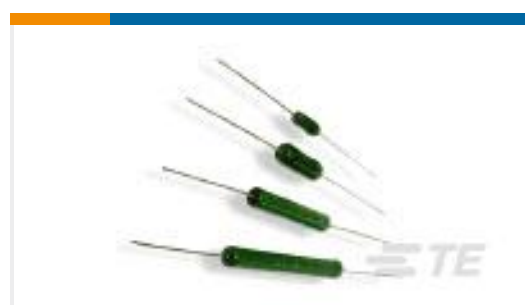
TE Part #3-1623774-6 C14 4R7 5% (LOOSE)